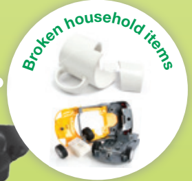
Broken household items