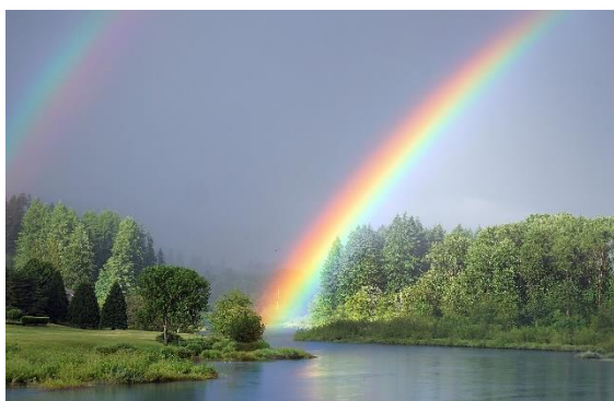
Photo of a rainbow over trees and water.

Why is there a particular order behind the colours?