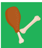
meat & bones