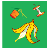
fruit & vegetables