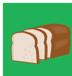
bread & pastries